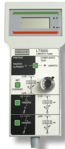
LT3000, an industry-leading testing instrument

* Software updates pertain only to qualifying Bender manufactured equipment